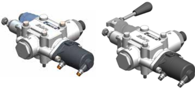
UT201 Single Pressure