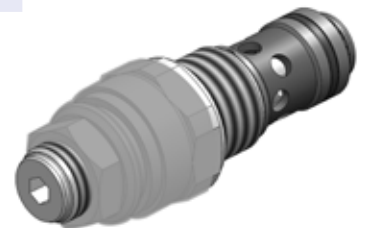
Single Pressure relief