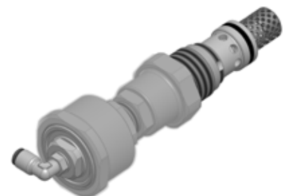
Dual Pressure air operated relief